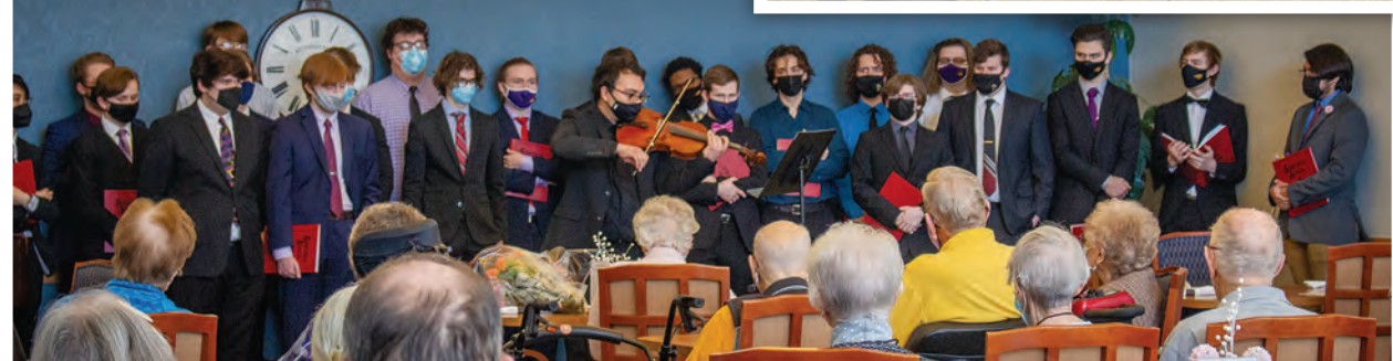
Phi Mu Alpha, a men's music fraternity from the University of Northern Iowa, entertained Windhaven residents.