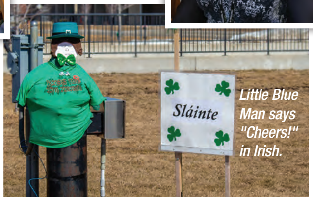
Little Blue Man says "Cheers!" in Irish.