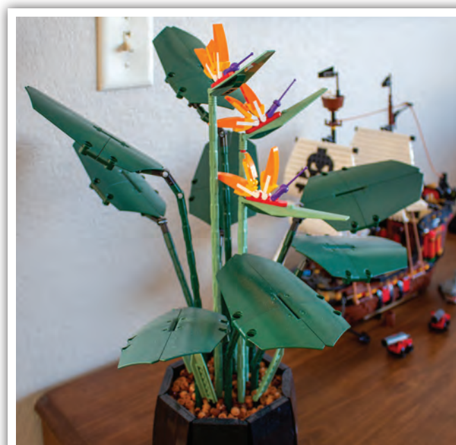
A bird of paradise is a surprising Lego set and it doesn't need watering!