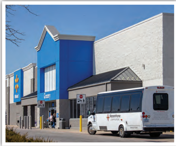
WHC buses will be a familiar sight out in the community once again.

In March, after two long years, Windhaven assisted living residents could once again head out together to shop. The weather was perfect for excursions to Fareway and Walmart on a Western Home Communities bus.