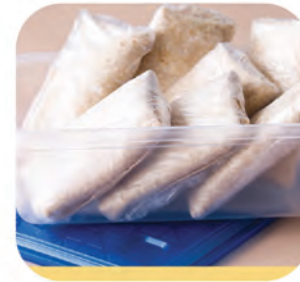
Cook Now, Enjoy Later