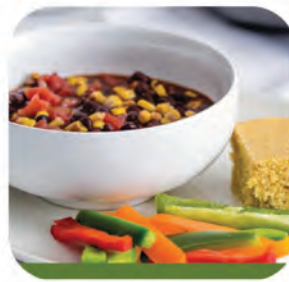
Cooking for One or Two