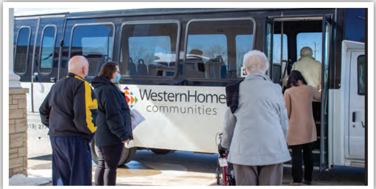
Residents wait to board for a recent trip to Fareway.