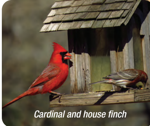
Cardinal and house finch