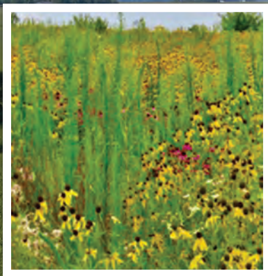
Wildflowers growing in the prairie strip at the Kramer's farm.