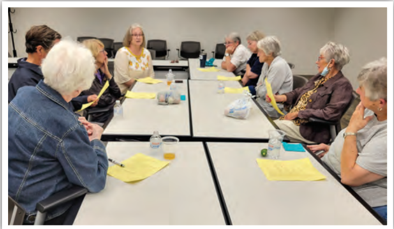
Caregivers meet regularly in person and online via Zoom.