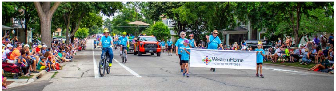
Sturgis Falls parade 2023

Transportation will be provided to the staging area and back to campus after the parade. Watch for more details to be provided at resident update meetings and in the June Journal.