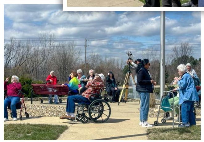
Windhaven residents gather to see the solar eclipse on April 8.