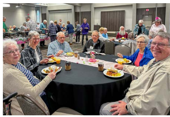
Volunteers celebrated with smiles and good food.