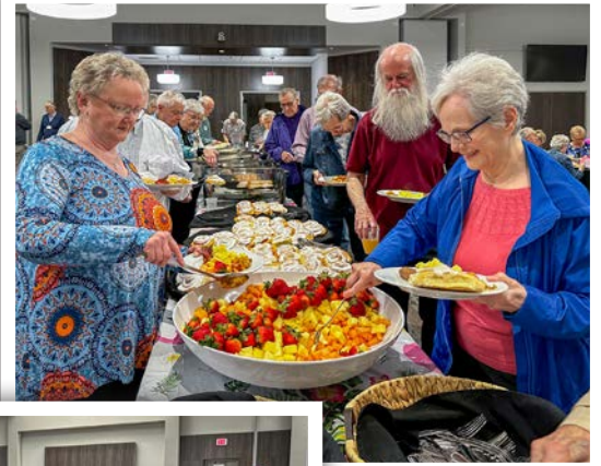
A bountiful breakfast awaited WHC volunteers at this year's appreciation breakfast, held April 17 at Diamond Event Center.