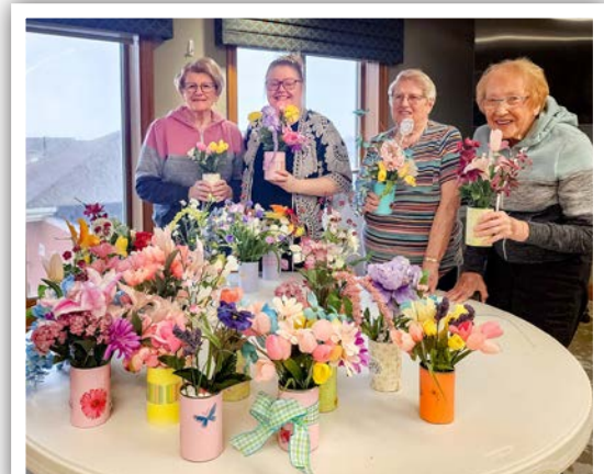
The Prairie Wind crafting group created spring bouquets for Windhaven and Thalman.