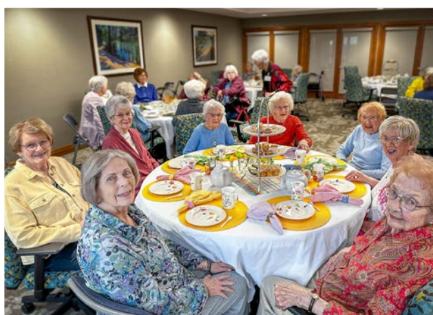
The women of Prairie Wind celebrated spring's arrival with a tea party in late March.