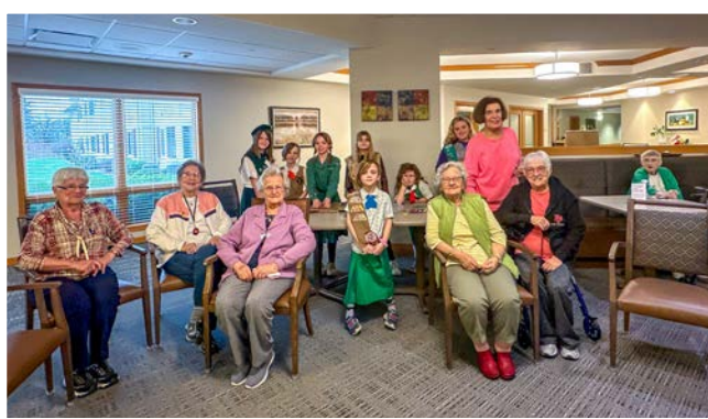
Girls Scouts visited Windhaven in early April, sharing stories with residents of scouting activities then and now.