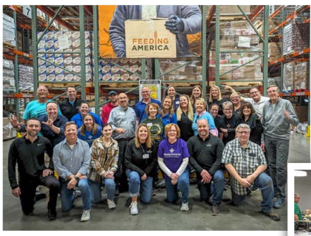
Department directors volunteered together at the Northeast Iowa Food Bank as part of National Volunteer Month.