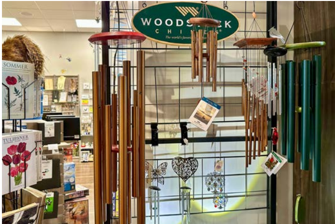
Chimes are just one of the many home decor items featured at The Market in October.