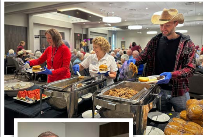
Western Home employees served up good grub to residents at BBQ Bash.