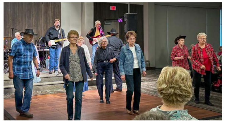
Line dancing, anyone?