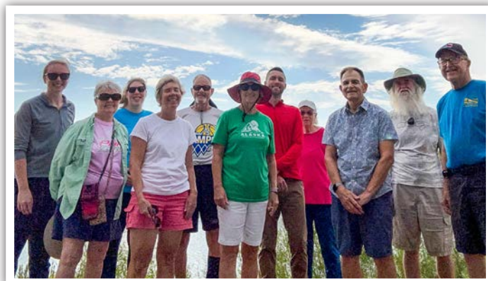
Fortified Life members on a morning walk around Prairie Lakes.