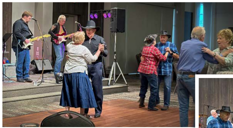
Ever popular, The Vinyl Frontier provided the dancing music for our annual BBQ Bash at Diamond Event Center.