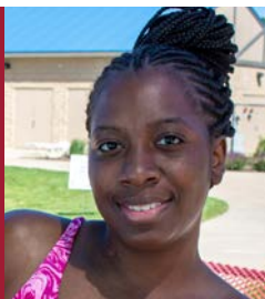
AQUARIUS BUNCH 5 years October 8 CNA-HHA, atHome