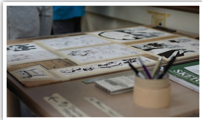
Artwork created by one of our University of Northern Iowa students as part of the Meaning of Home project.