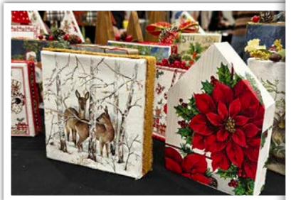
Dee Way offered her festive wood block crafts.