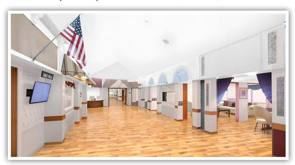
An artist's concept showing what an updated living area at Thalman Square could look like after the "town square" concept is replaced.

A timeline for the work is being developed. Watch future issues of The Journal for progress updates throughout the year.