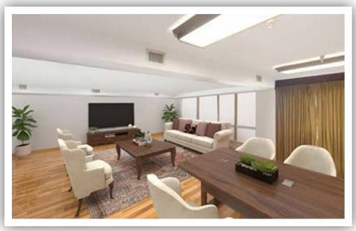
New flooring and furniture will be featured as part of the renovation.

Décor trends come and go as time goes by. On the heels of a recently completed redecorating project at Windhaven Assisted Living, a new look is being designed for the attached Thalman Square Memory Support Assisted Living, which opened in 2006.