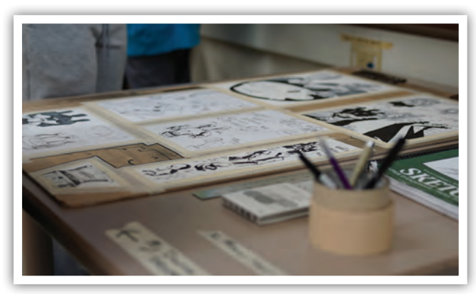
Artwork created by one of our University of Northern Iowa students as part of the Meaning of Home project.

that emerged as meanings of home: memories, sensory, territory, comfort, choice, relationships, culture and traditions, and time and movement.