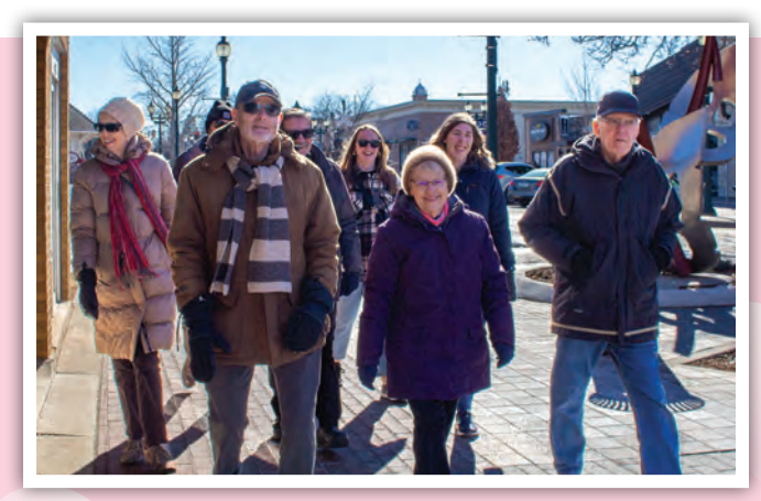
Fortified Life members stretch their legs downtown on a recent spring-like day in February.