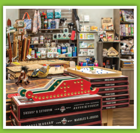
You can't miss the big selection of wooden games at The Market!