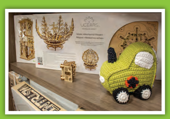
You'll find a variety of 3D kits by UGears at The Market (supply varies).