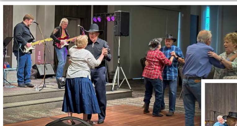
Ever popular, The Vinyl Frontier provided the dancing music for our annual BBQ Bash at Diamond Event Center.