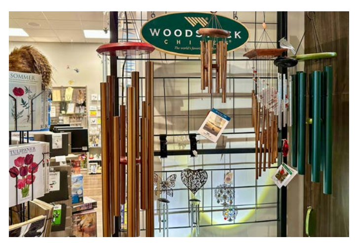
Chimes are just one of the many home decor items featured at The Market in October.