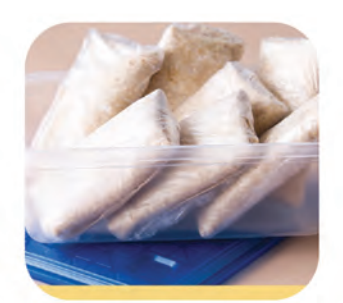
Cook Now, Enjoy Later