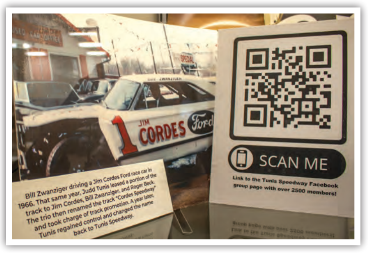
A QR code offers a quick and fun way to find Tunis Speedway's Facebook group.

"midget auto races" at Tunis Speed Bowl.