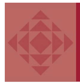
JULIE METHER 5 years September 4 CNA-HHA, atHome

In September, these employees of Western Home Communities are celebrating a milestone anniversary. Join us in thanking them for their service.